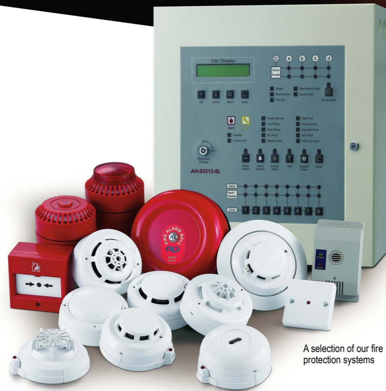
A selection of our fire protection systems

From a 30-year Taiwan-based manufacturer