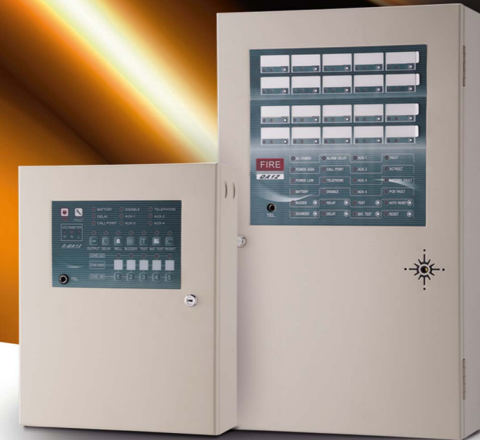
5-QA12/QA12 Conventional panels

Our featured product is a good example of the advanced safety equipment we produce. This fire alarm master-control module can connect up to 2,000 addressable devices. It also complies with EN 54 Part 2 and Part 4. Plus, it's available in four-, eight- and 32-zone models, so no matter whether your customers want to protect large or small areas, you'll have something to offer them. For more information, visit us online at www.horinglih.com today.