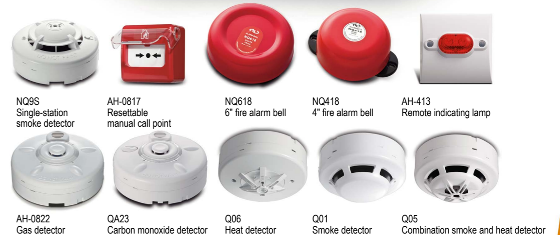
NQ9S Single-station smoke detector